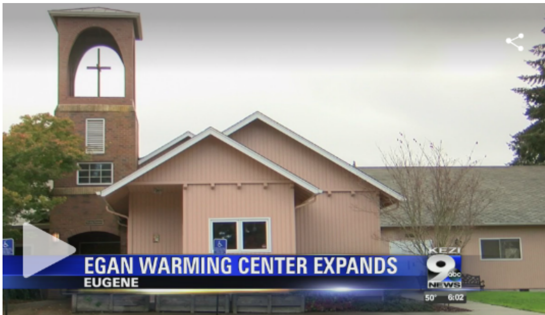
St. Mathews Church on 4110 River Road is the new Egan Warming Center in our neighborhood

Please go to the website eganwarmingcenter.com and complete a volunteer application: