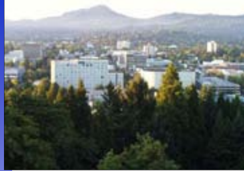
View from Skinner Butte

nected. When asked what would encourage them to become more involved, the top answers were knowing other people who attend meetings and events, and receiving more information about their neighborhood association.